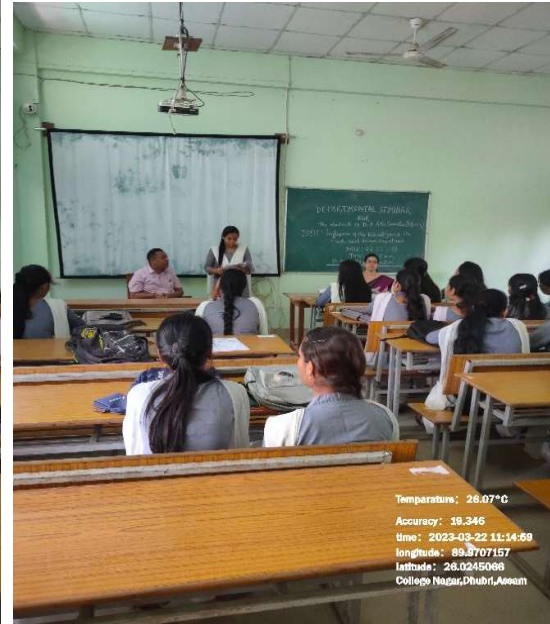
Student of B. A. 4th Sem Honours presenting their papers