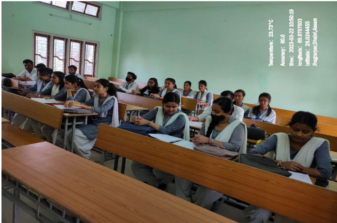
Students attending the Departmental Seminar